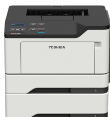
e-STUDIO408P w/ 550-sheet Drawer